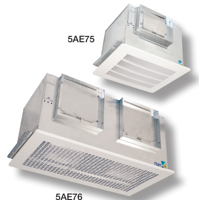
5AE75 and 5AE76 Insulated Ventilators