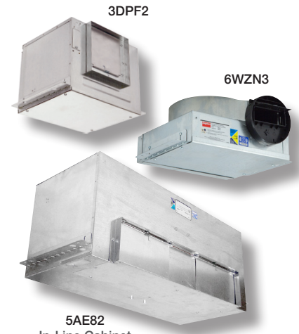
3DPF2, 6WZN3, and 5AE82 In-Line Cabinet Ventilators

Call or visit your local branch or go to grainger.com/dayton for complete product line information.