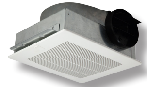
5AE69 Silent Low-Profile Ceiling Fan